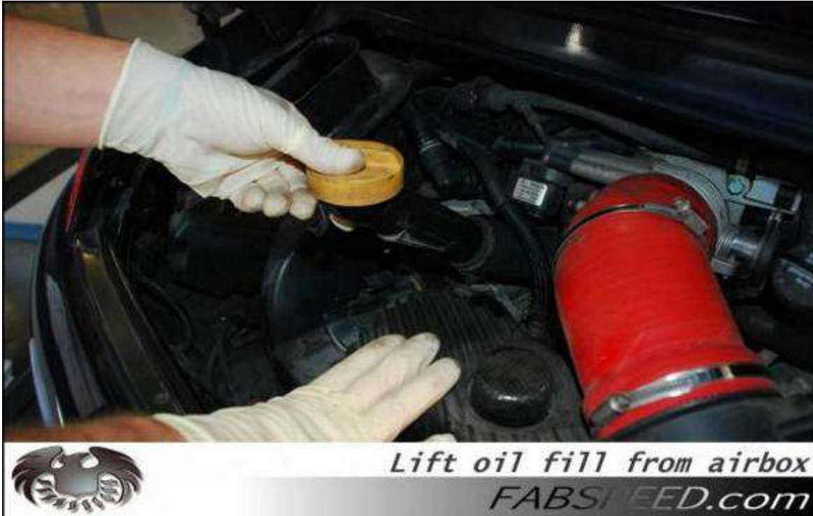
STEP 6: Lift the oil fill from the airbox.