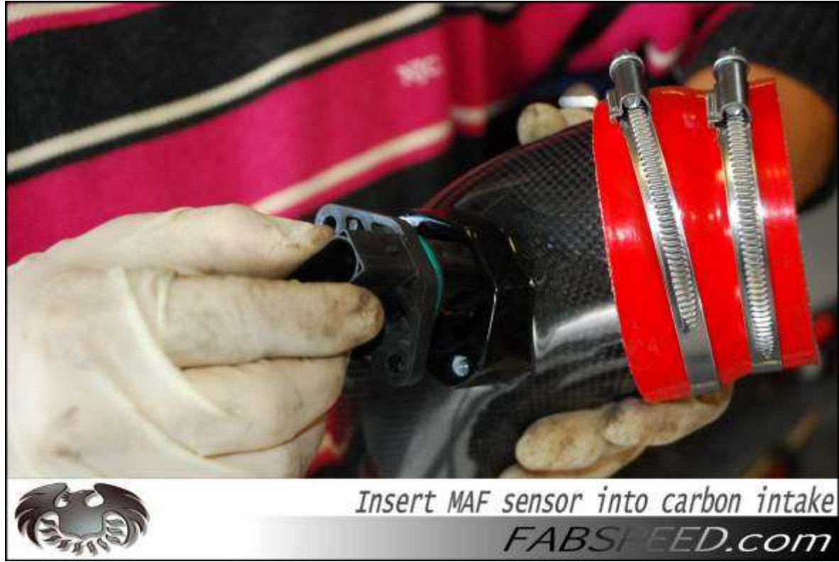
STEP 19: Insert MAF sensor onto the carbon fiber intake.