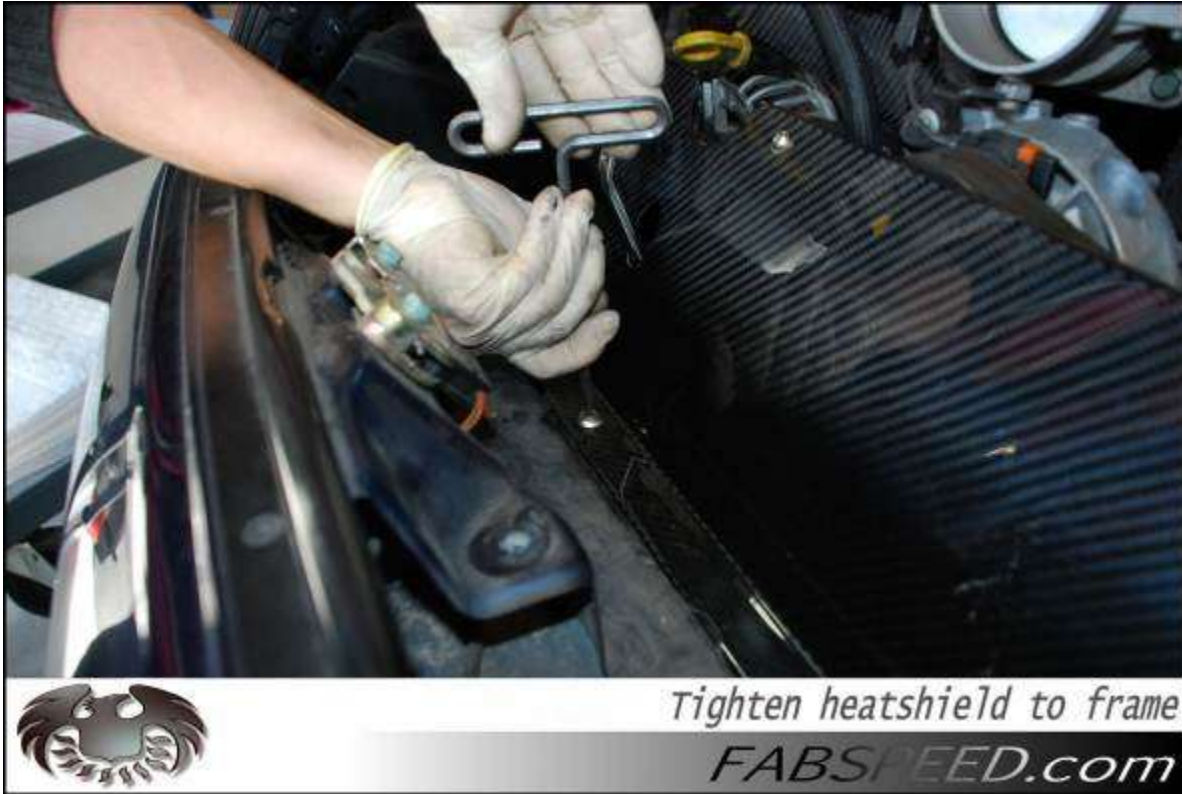
STEP 18: Tighten heatshield with 7/8 HEX-head.